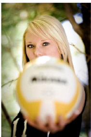
Face Blocked – Too Far